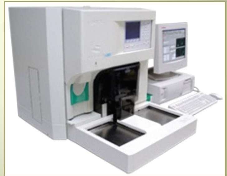
Hematology Analyzer $73,600