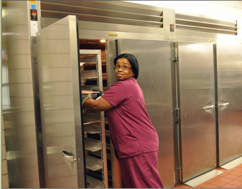
Air-Curtain Refrigerator $9,945

Food Warmers-$8,845 & Refrigerators-$9,919