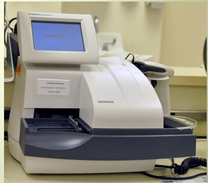
Urine Strip Reader $7,199