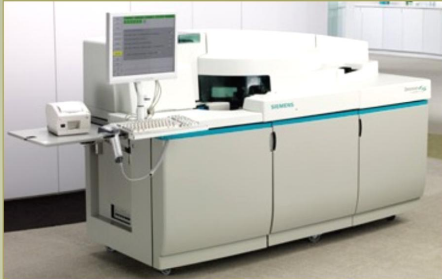
Chemistry Analyzer $311,600